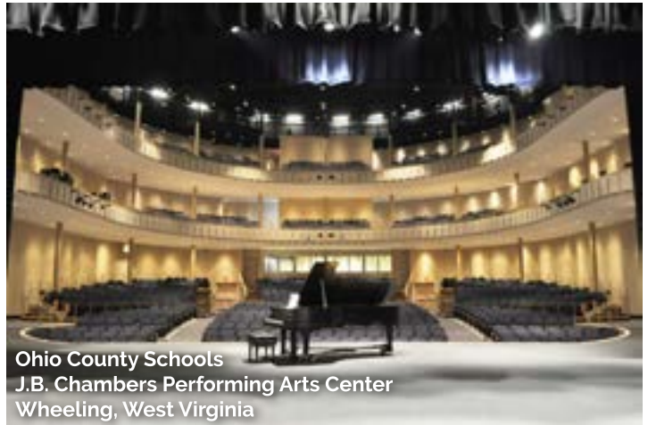
Ohio County Schools J.B. Chambers Performing Arts Center Wheeling, West Virginia