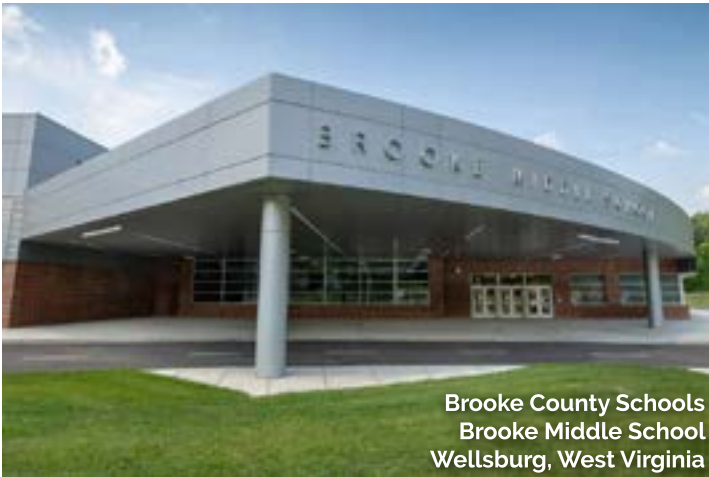
Brooke County Schools Brooke Middle School Wellsburg, West Virginia

Architects + Engineers + Learning Environment & Educational Facility Planners + Energy Efficient "LEED" Designers + HVAC Commissioning Process Provider + Interior Designer + Historic Preservationist + Construction Administrators