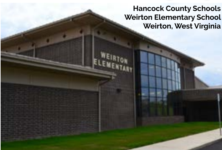
Hancock County Schools Weirton Elementary School Weirton, West Virginia