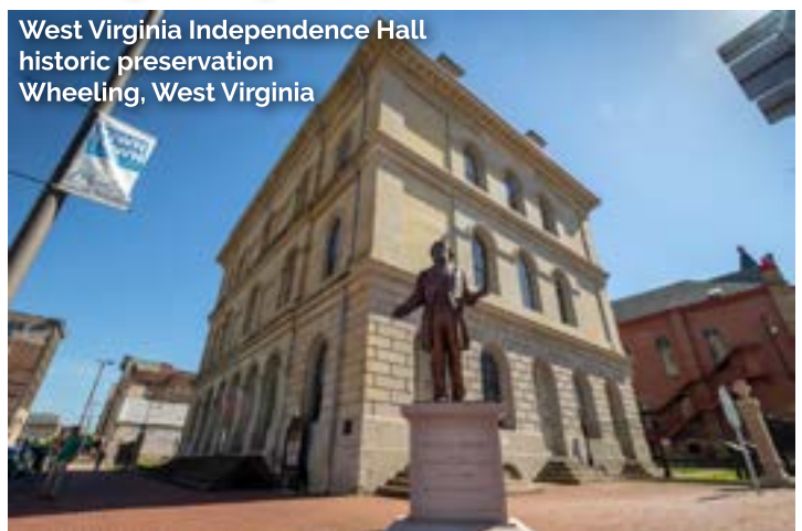
West Virginia Independence Hall historic preservation Wheeling, West Virginia